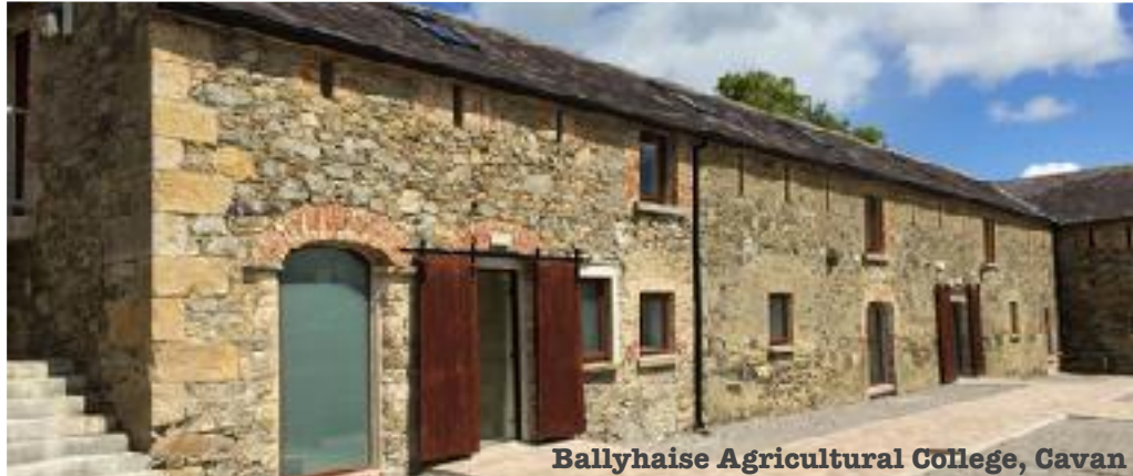
Ballyhaise Agricultural College, Cavan